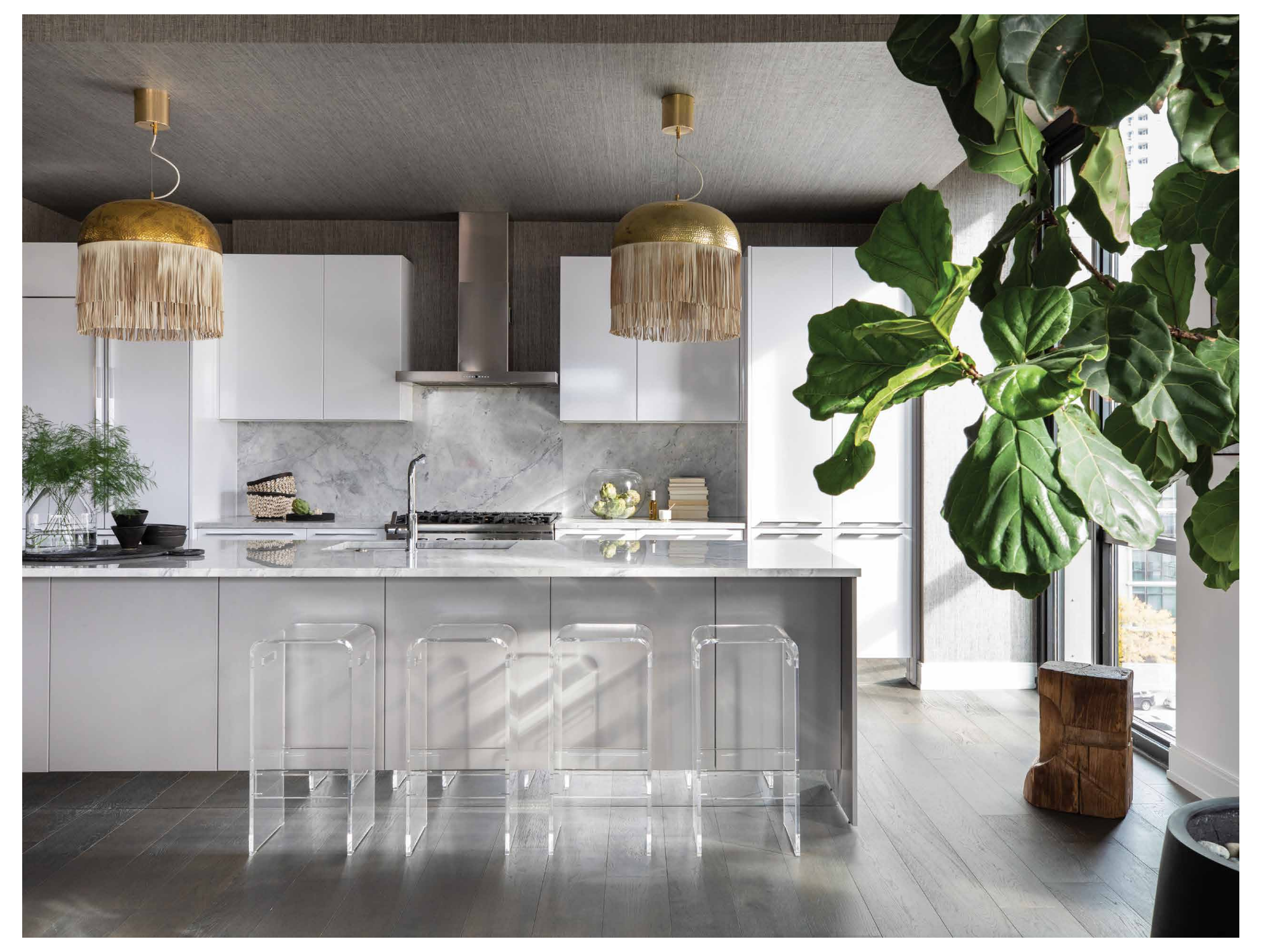
From left: The kitchen is a visual feast, with white cabinets, marble countertops and the clients' own Lucite stools offset by an earthtoned ceiling covering by Phillip Jeffries and a pair of oversize pendant lights by SHO Modern; an inviting nook in the living area.