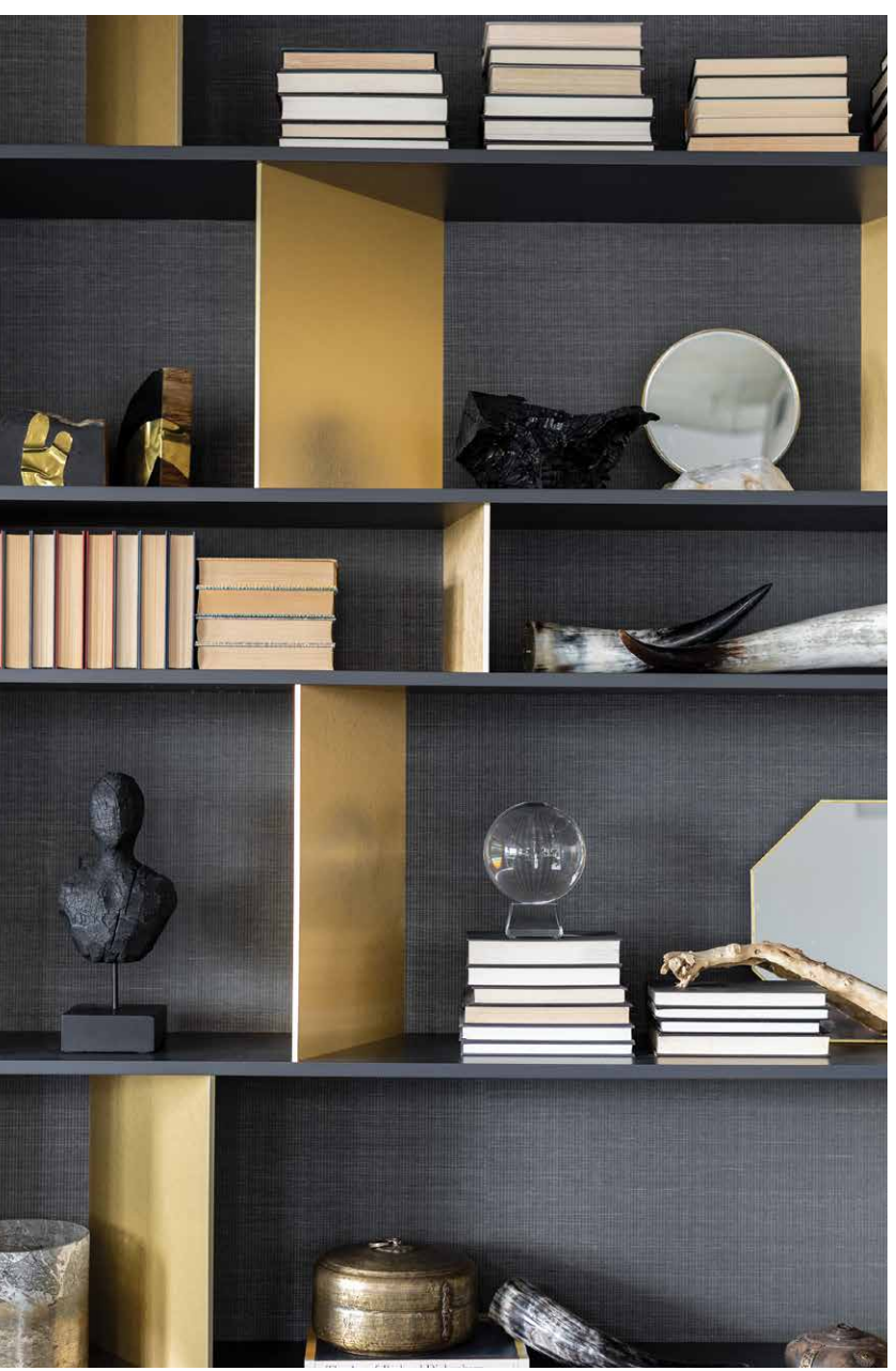
From left: Handsome custom display shelving designed by Project Interiors and fabricated and installed by Demeter Millwork runs the length of the space; artwork by Gary Weidner stands out in the master bedroom.