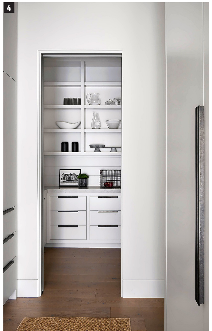
1. The foyer is a study in contrast: A floating entry table from Bradley tops a Benisouk Moroccan rug, providing space to plop down keys or shopping bags exactly where it's needed. Situated just off the entryway, the sunroom includes a custom sofa by C Sanchez Upholstery in a Pindler fabric as well as round ottomans from Arteriors. 2. Sheer draperies from Carnegie Fabrics softens light streaming into the dining area. A chandelier from Katy Skelton Home illuminates a custom dining table and vintage chairs sourced from Project Interior's collection. 3. An untraditional approach to the kitchen forgoes a backsplash and some upper cabinetry for a simplified vibe. Soothing gray cabinetry with blackened steel hardware by New Style Cabinets juxtaposes with soft-white walls and marble and granite countertops by Sprovieri's Custom Counters. 4. "Less is more" was the mantra for the Projects Interiors team that designed this family home in Hinsdale. New Style Cabinets created custom millwork throughout the home, including for the whitewashed kitchen pantry.